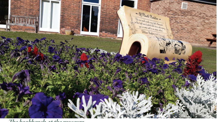
The bookbench at the museum