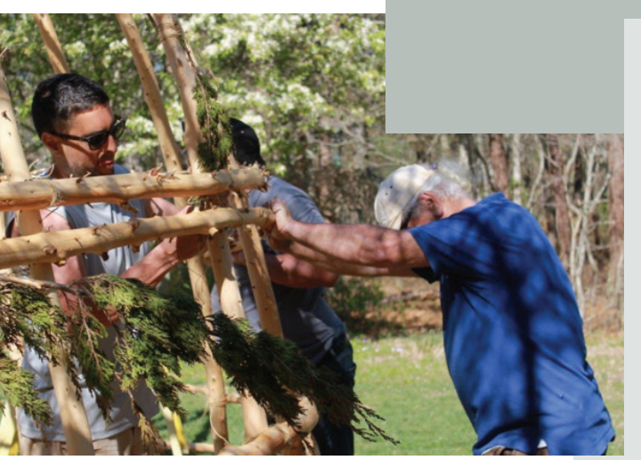
Building a Wetu