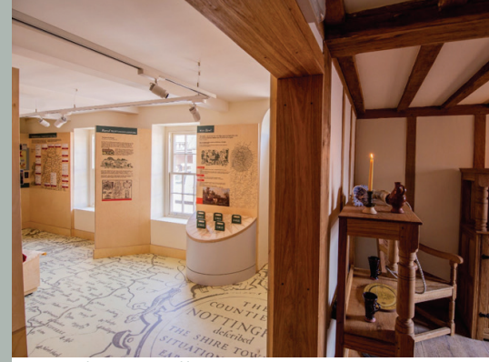
The Pilgrims Gallery

Holiday activities will be taking place across the trail sites this summer, and we have included some dates for your diary in this newsletter. For the most up to date information, visit our events pages at www.pilgrimroots.org or pop into the Pilgrims Gallery.