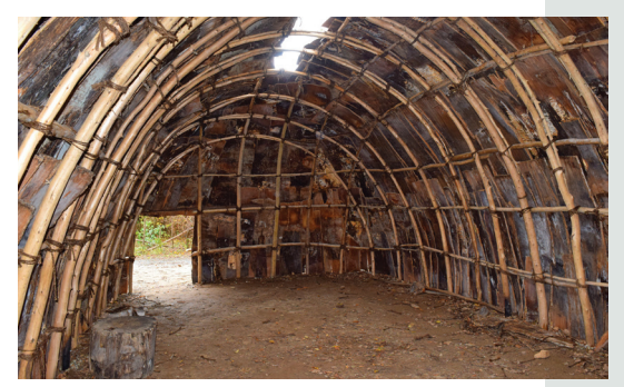
Inside a Wetu