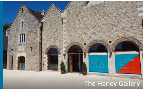
The Harley Gallery

Visit www.welbeck.co.uk for events, changing exhibitions and seasonal produce.