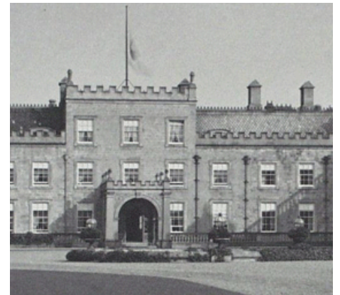
The historic Welbeck estate

Welbeck Abbey was founded as a monastery in 1153. Bess of Hardwick's youngest son, Sir Charles Cavendish, acquired Welbeck in 1607, and since then the estate has continued to be handed down through the family. Welbeck Abbey's State Room guided tours are open to the public for 33 days during the summer.