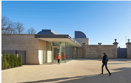
The Portland Collection

One of the most important aristocratic collections in the UK, it casts a light on family history, art history and history in general, all shown in a spacious purpose-built gallery.