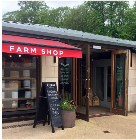
Welbeck Farm Shop