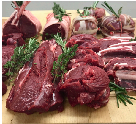
Hands on experience with Venison