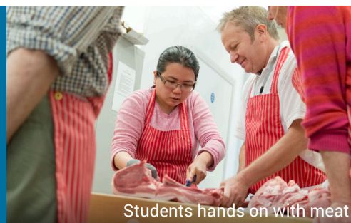
Students hands on with meat